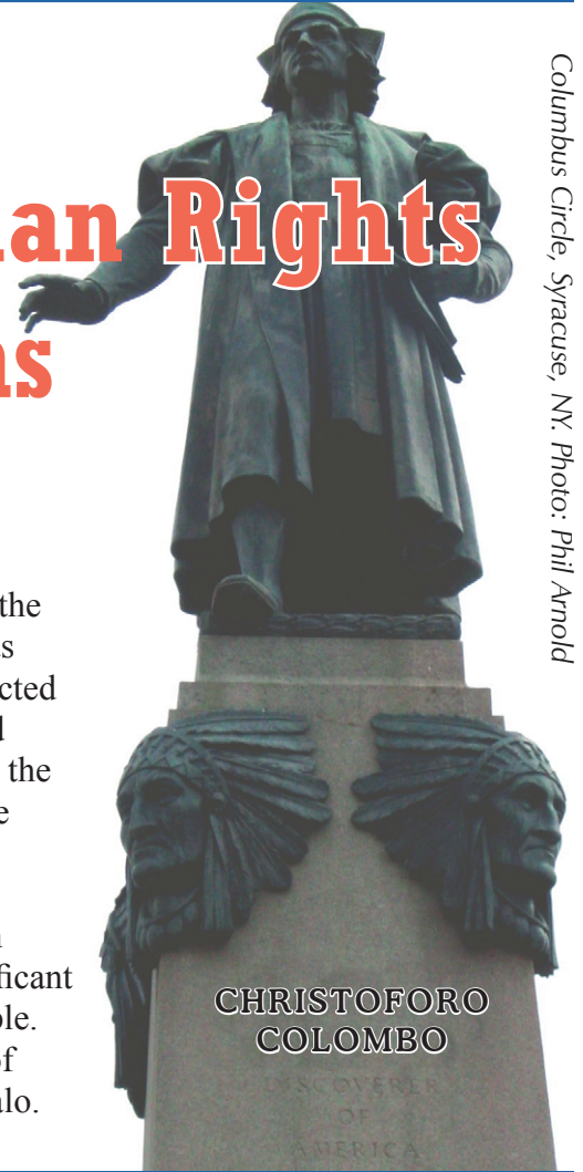
Columbus Circle, Syracuse, NY.