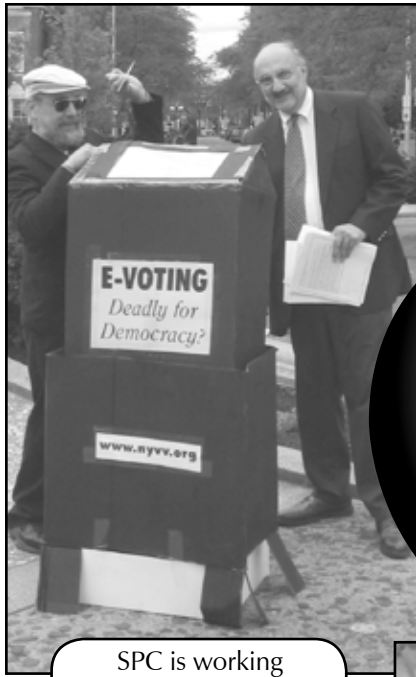
SPC is working through the Progressive Coalition to help ensure that our votes will be counted correctly in Onondaga County.