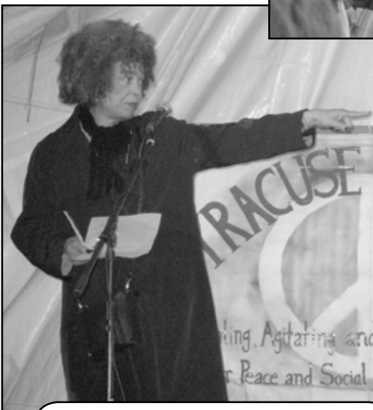
Angela Davis was a featured speaker at SPC's Voices Against the War rally that brought out almost 200 people on a cold, rainy October evening.