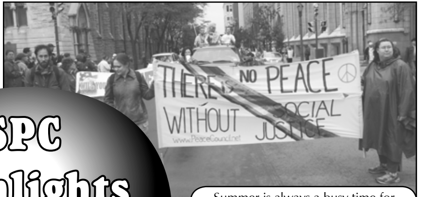
Summer is always a busy time for outreach, and SPC tables and marches as part of several downtown events. We continue to be the only group to march in both the local Juneteenth and Pride Parades, as far as we know.