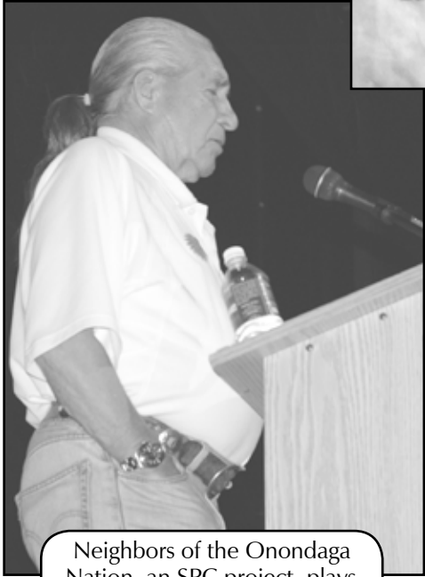
Neighbors of the Onondaga Nation, an SPC project, plays a large role in organizing the successful speakers series at Syracuse Stage. Oren Lyons spoke Sept. 11 about "Racism, Native American Human Rights and the UN." The next talk will be held Nov. 27.