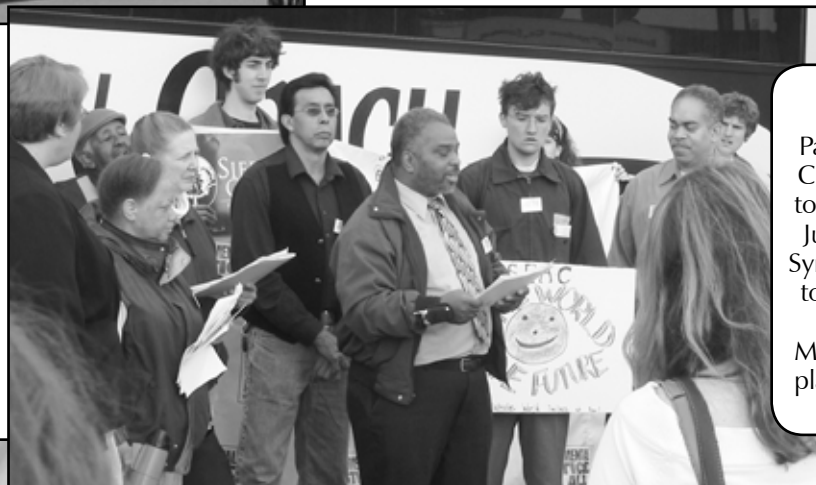
SPC joined with the Onondaga Nation, Partnership for Onondaga Creek, NAACP and others to bring the Environmental Justice For All bus tour to Syracuse in September. The tour brought political and media attention to the Midland sewage treatment plant and Onondaga Lake.