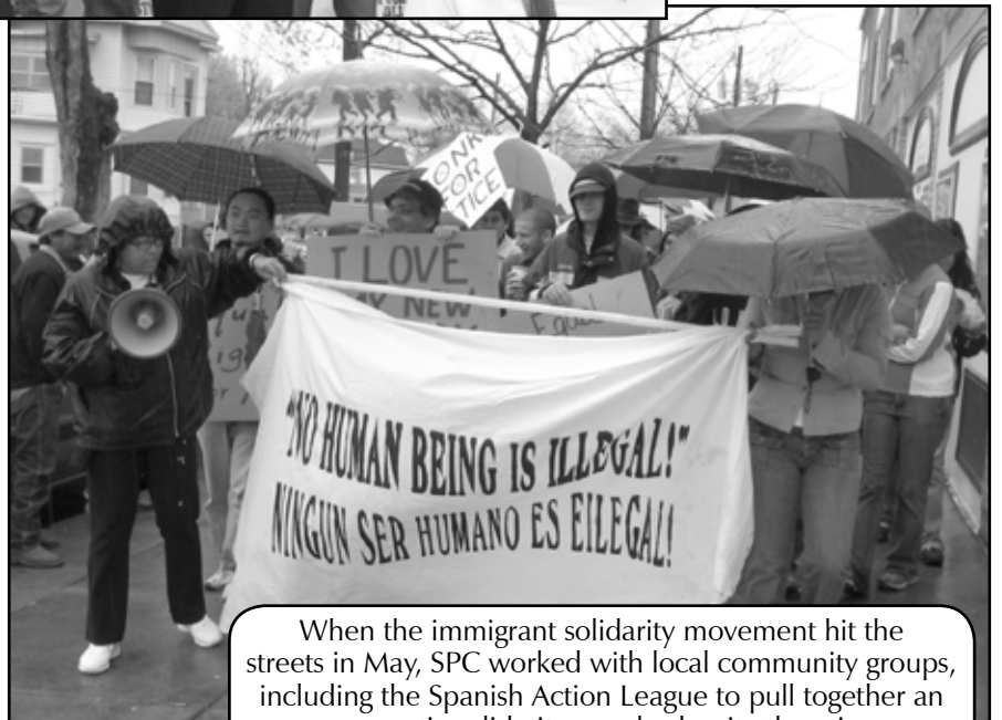
When the immigrant solidarity movement hit the streets in May, SPC worked with local community groups, including the Spanish Action League to pull together an energetic solidarity march, despite the rain.