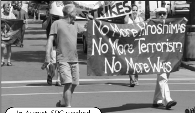
In August, SPC worked with other local groups to organize the annual Hiroshima Day Procession. It was followed by speakers and lobby visits to our local Federal Representatives to advocate a responsible US policy towards Iran.