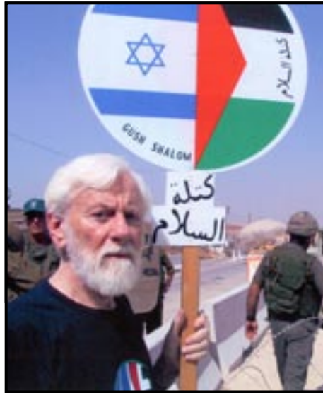
Longtime Israeli peace activist Uri Avnery demonstrates at a-Ram checkpoint, 2002.