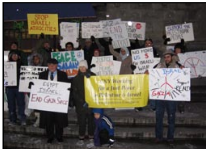
About 40 people marched in downtown Syracuse to support the Gaza Freedom March, December 28, 2009.

get through, the message of international support rang clear. Solidarity marches were held in cities around the world, including the one in Syracuse on 12/28. This is an