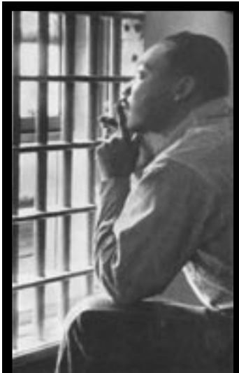
Far from being a simple do-gooder, Martin was a radical organizer who was willing to put his life on the line to confront the structural injustices of poverty, racism, and militarism.