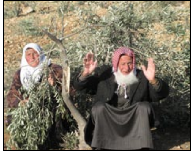
A Palestinian landowner (right) sits amongst his destroyed olive trees in Khoruba, West Bank.

At times we were able to talk to the soldiers. Those we talked with seemed to have the same lack of information that our