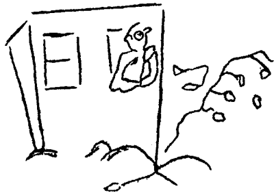
This is the person who works for peace

As you of course realize, there is no time when candidates for public office are so sensitive to public opinion as they are in the weeks just preceding a national election. The accompanying blue sheet makes simple, practical suggestions; by following them you share in a nation-wide movement which has accomplished much already toward registering the popular demand for peace on the minds of the political leaders. This impression will be greatly strengthened if, during the last days of the campaign, each candidate receives a large number of such communications. IF YOU WANT PEACE, SAY SO! NOW!!!