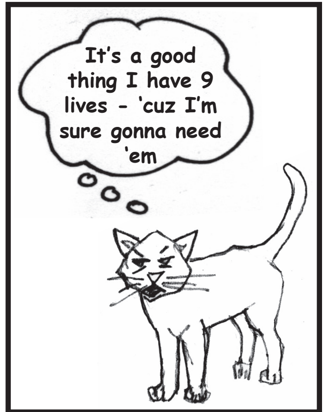
Graphic: Kate Woodle

92% of NYS voters polled in 2006 rated hospitals the highest priority among community and civic organizations - www.hanys.org